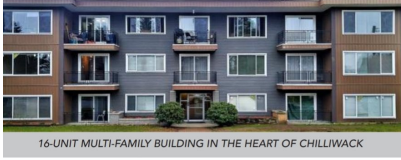
16-UNIT MULTI-FAMILY BUILDING IN THE HEART OF CHILLIWACK